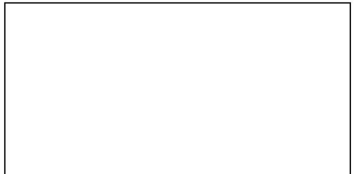
Figure 2: Device address switch settings

The 1912 Command Processor supports up to four 704 loop expanders. These can be assigned to addresses 1 to 4 only.