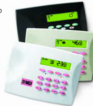
Thinline™ Series Icon Keypads available in white, ivory, and black.

save time and phone calls The exclusive cancel/verify feature prompts you to cancel or verify (confirm) an alarm right at the keypad. This saves you time in having to call the monitoring station to cancel the alarm, or wait for their call. The cancel/verify feature also allows you to turn off the audible