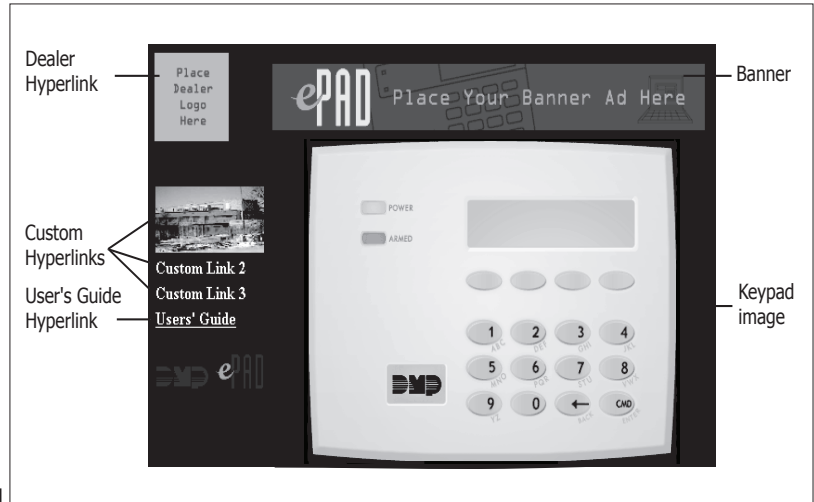
Figure 2: Sample of how the ePAD could look on the screen

You may also press the keys on the keyboard that correspond to the keys on the ePAD. Press the digit keys (0 through 9) as you would on a standard keypad. You can also use the number pad and the numbers on the top of your keyboard to enter information. Be sure that the Num Lock is set to use the number pad.