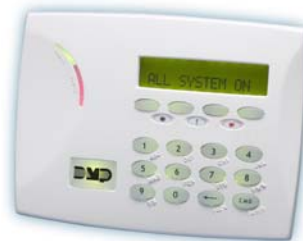
Thinline Keypad - Green backlit keys and logo turn Red during an alarm.

The 7000 series includes 7060, 7063, 7070, and 7073 models. The Aqualite Series includes 7060A, 7063A, 7070A, and 7073A models.