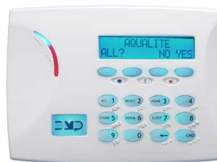
Blue Backlighting for Normal State