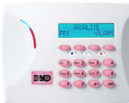
Red Backlighting for Alarm Conditions

In a normal state, both the keypad and logo backlighting remain Blue. However, during an alarm state, the keypad and logo turn Red. The change in color allows persons on-site to instantly recognize an alarm condition.